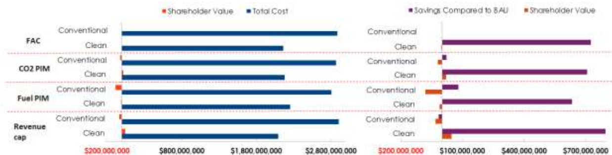
Figure 3. Capacity requirement: total cost, shareholder value, and savings compared to business as usual 34

It is also important to consider the impacts of the two alternatives on segments of the utility's business where shareholder value is created. A DER-based strategy may, on net, reduce infrastructure needs in the distribution system, reducing a utility's opportunity to create shareholder value under COSR. Even when neutral on generation options, the utility may still prefer the option that justifies gold-plating the distribution system.