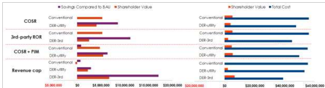
Figure 1. Distribution upgrade: Total cost, shareholder value, and savings compared to business-as-usual 23

third-party DERs for grid services, a benchmarked revenue cap applied over an eight-year MYRP aligns shareholder and customer value.